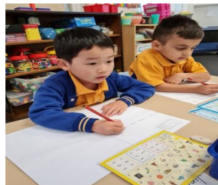
KA during writing